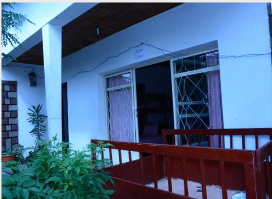
Oromia Safe house