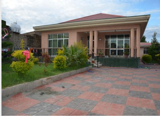
Adama Safe house