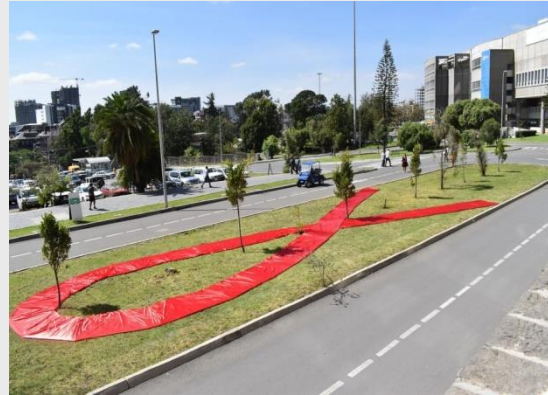
60 meters-long red ribbon, prepared by AWSAD