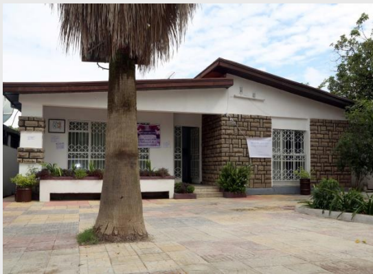
Hawassa Safe house