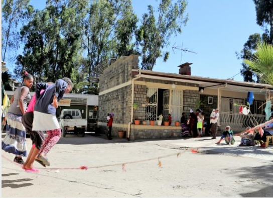
Addis Ababa Safe house