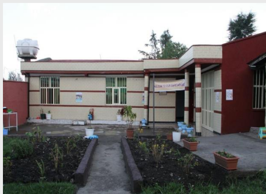
Dessie Safe house